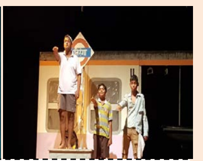
Cultural programme by children